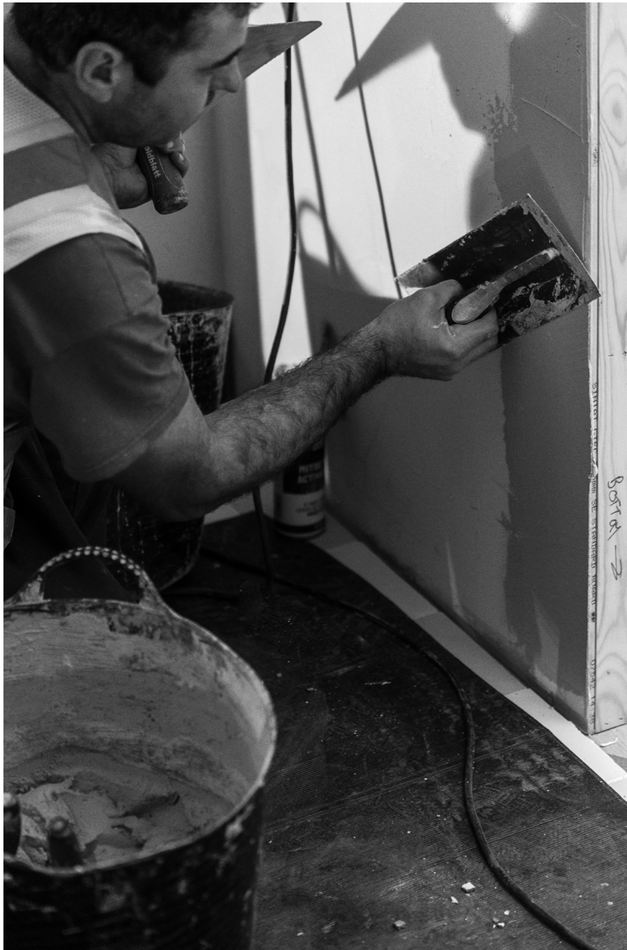
Clayworks Natural Wall Covering