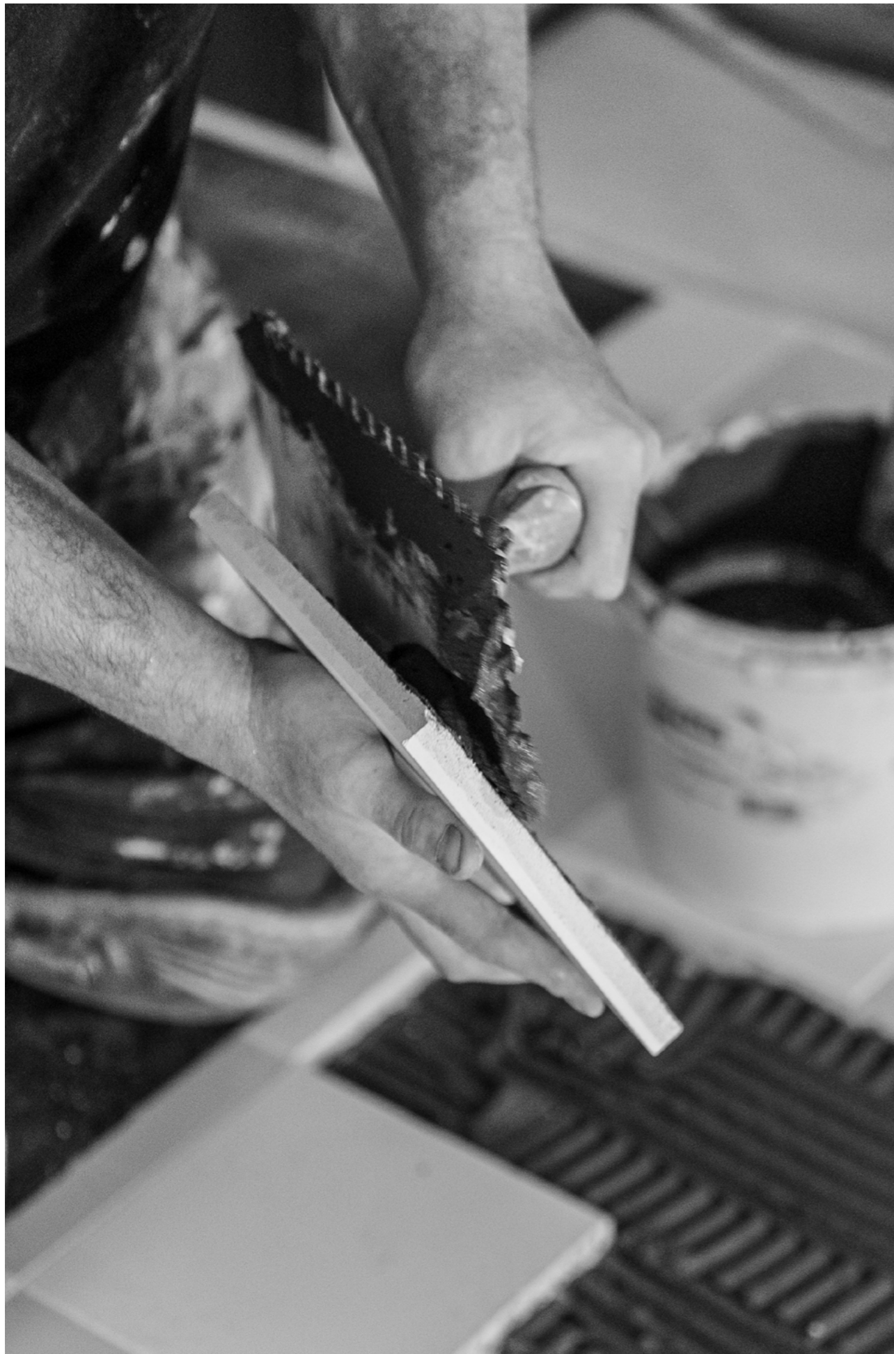
Mosaic Factory Floor tiles